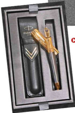
No celebration of fine writing is ever complete without the timeless presence of Parker. The Duofold Pioneers Collection features a grey lacquer barrel, 23K gold-plated cap and trims, and an 18K bi-tonal rhodium-plated nib. The intricately designed lid is chevron-patterned, and so is the black leather pouch. ₹1.25,000