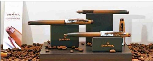
For most writers, a cup of coffee and a pen are essential to begin with. Well, what if we marry them? The Sheaffer Coffee Edition pens (fountain, ballpoint and more) are just the result of that idea; featuring a warm coffee-hued body, a coffee cup symbol on the cap, and award-winning colour design that was recognised in Italy in 2024. Ranging from ₹1,000 to ₹6,000