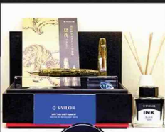
For admirers of fine art and collectors of exceptional writing instruments, this Sailor King of Pens Naginata Togi Ebonite Fountain Pen is a rare treasure. Inspired by Jakuchu's (Japanese Painter) iconic Tiger painting, this 212nd of only 500 products worldwide features a vivid 'Mouko Yellow Tiger' ebonite body crafted using the traditional Chirashi layering technique. Its striking brownish-yellow-black colourway evokes the bold energy of the original artwork. The pen is fitted with a 21K bicolour gold Naginata Togi nib. ₹2.25 lakh