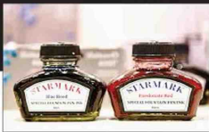
For many Bengalis, Sulekha isn't just ink, it's nostalgia in a bottle. In collaboration with Starmark, an iconic set of ink jars is also a part of the pen festival line-up.