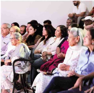
It was a full house at the amphitheatre of Kolkata Centre for Creativity.