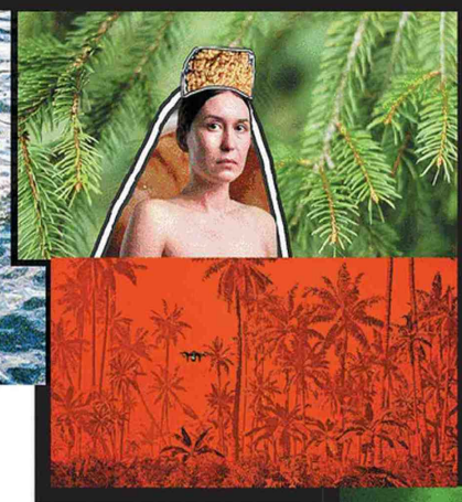
We Are What We Eat (2022) by Natalia Ehret

"EAEFF is a celebration of boundary-pushing art and cinema, bringing voices from around the world into a powerful dialogue. We are thrilled to provide