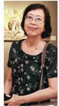
Consul General of Thailand in Kolkata Acharapan Yavaprapas