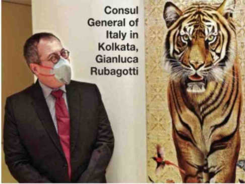
Consul General of Italy in Kolkata, Gianluca Rubagotti