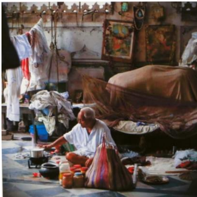
Photographs from the exhibition 'My Kolkata in Kolkata', curated by Reena Dewan, in association with West Bengal Tourism; a "Tajia" horse created by artisans and students

28 January 2020: In celebration of their second year, Kolkata Centre for Creativity (KCC) will host a series of immersive and interactive exhibitions and performance art pieces at the India Art Fair 2020 in New Delhi. KCC's booth (H02) in the 'Institutional